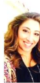
NEVADA INTERESTS CHAIR