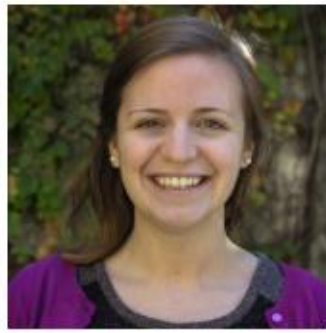
MEMBERSHIP CHAIR ELECT