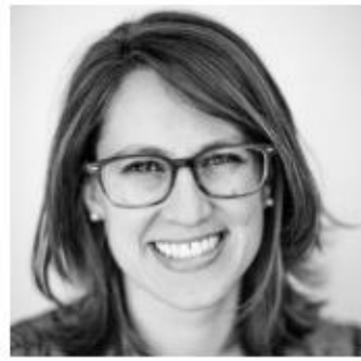
PROFESSIONAL DEVELOPMENT CHAIR ELECT