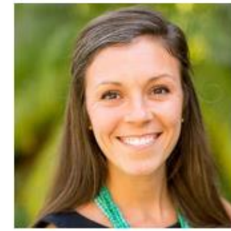
PROFESSIONAL DEVELOPMENT CHAIR