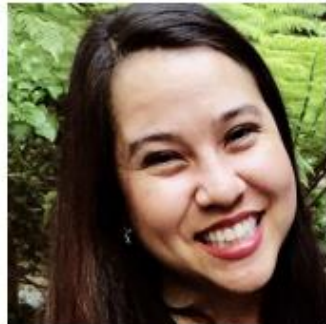
Nitzya Cueva-Macias Peninsula Bridge