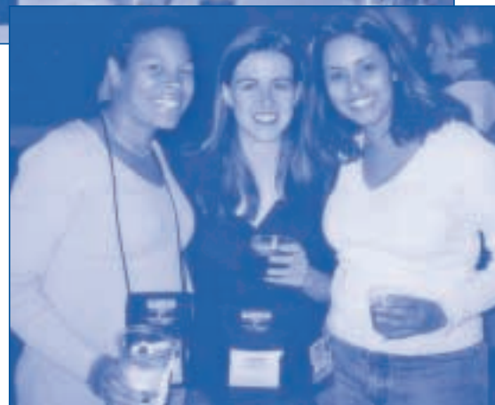
WACAC at NACAC social in SLC

role in secondary schools was passed by both house of the legislature and sent on to the Governor. It is in limbo currently because the Senate recalled the legislation before the Governor could make a decision on the bill.